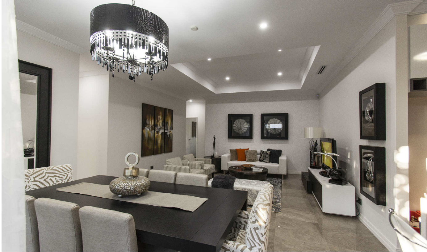
The design brief was to create a sustainable, energy-efficient villa.